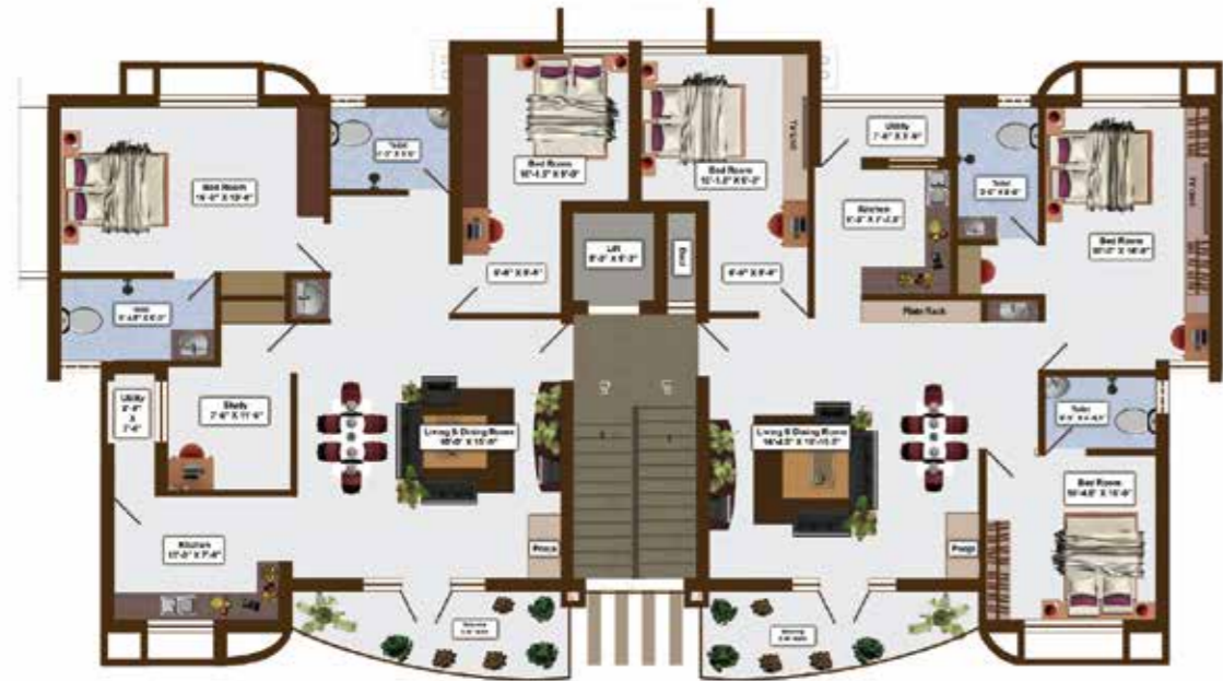
BLOCK A & C FLOORPLAN 2.5 BHK: 1319 SQ FT